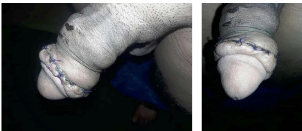
Figure 3. The status of patient after three months