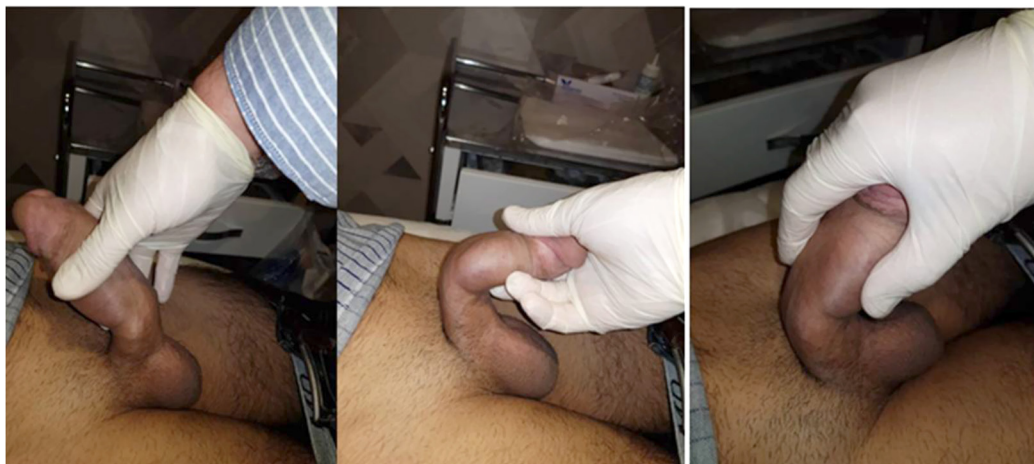
Figure 1. The patient penis was bent in the position of third/forth from distal in spite of the having normal erection

Follow-up after two and six weeks showed a significant improvement in the patient. After one year the patient had no problem and our result of the surgery was completely satisfying (Figure 4).